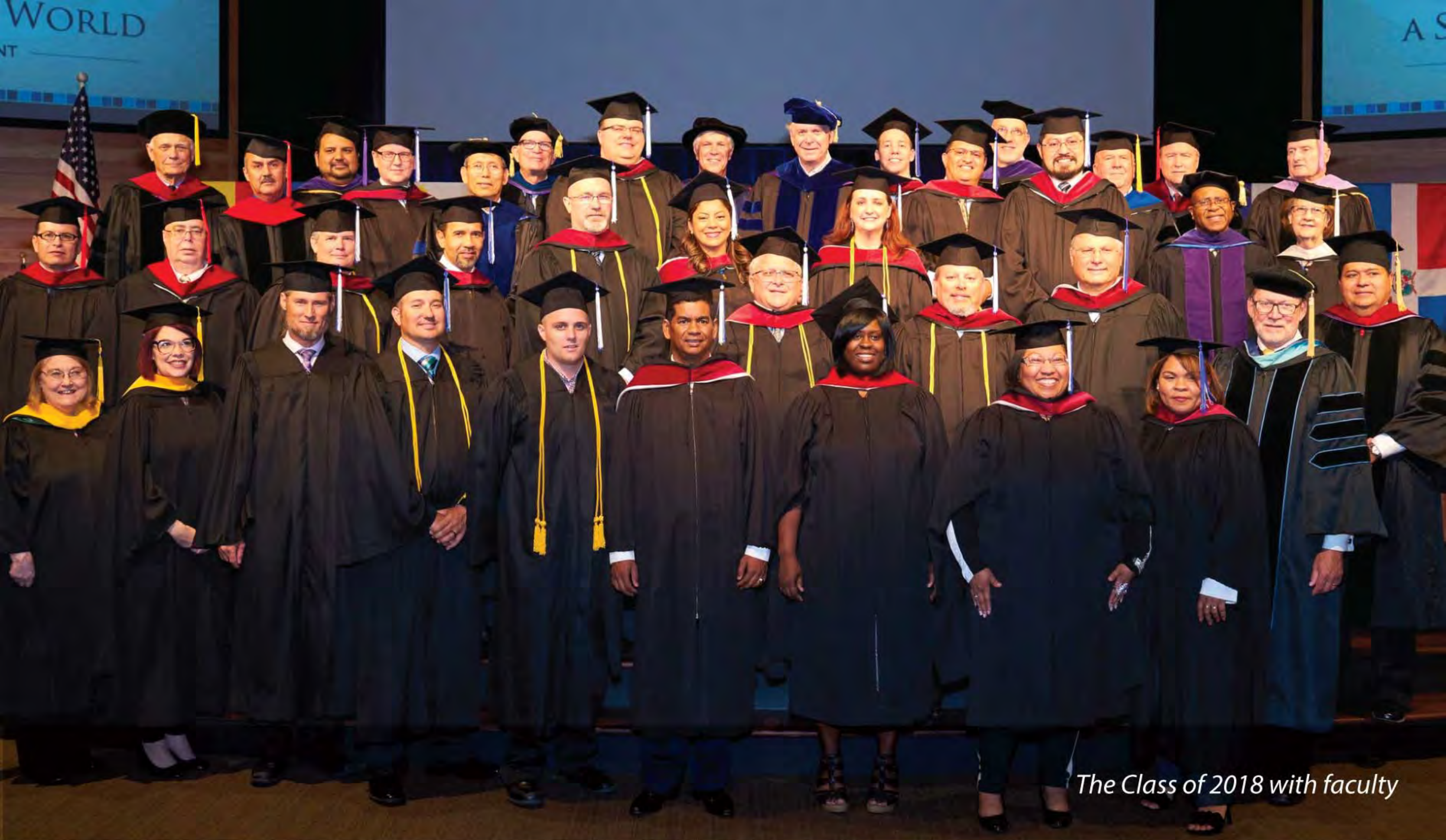
The Class of 2018 with faculty