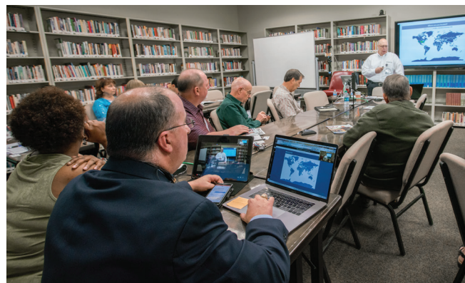
Over 100 people participated in our kickoff seminar in November.

If you wish to view our first community training event, visit facebook.com/graceschooloftheology to access an archived recording of the presentation. Watch for dates and details soon about our 2018 Chaplaincy Training Series.