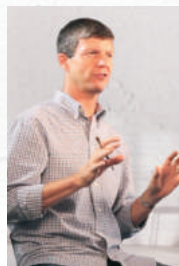
Director Discipleship Program Grace School Of Theology

"Building healthy biblical relationships in the midst of an academic pursuit is critical for holistic preparation of each student to be successful in life and ministry."